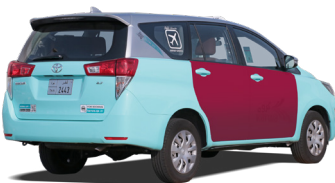
9. Airport Taxi