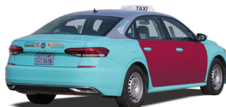
10. City Taxi