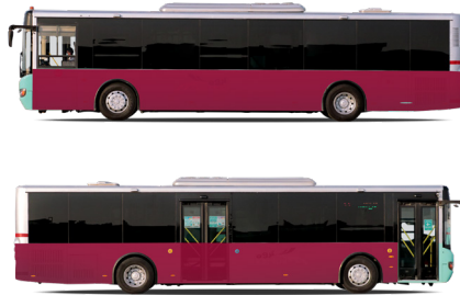
3. Two-side strip liner wrap