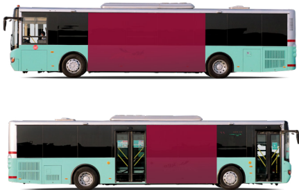
2. Two Sides Square Wrap