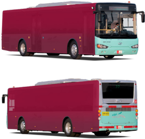
1. Two Sides Full Wrap