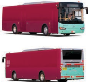
2. Two Sides Square Wrap